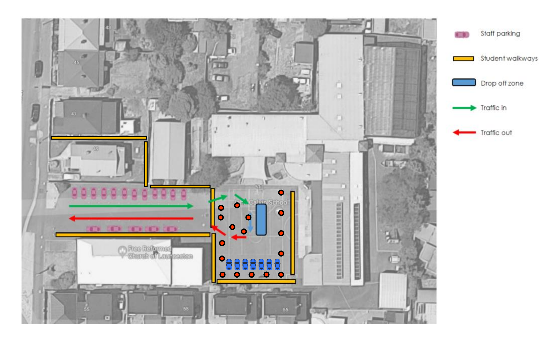
Morning Drop Off